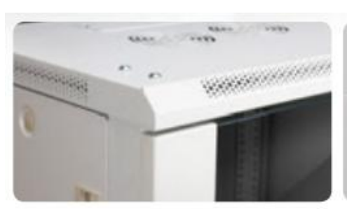
perforated frame, excellent cooling