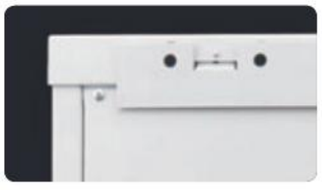
The design of back panel is convenient to install the wall