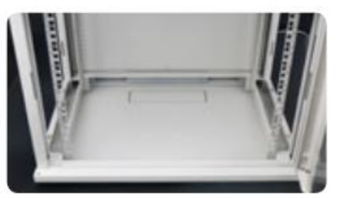
The top and bottom stripes are detachable to facilitate wiring.