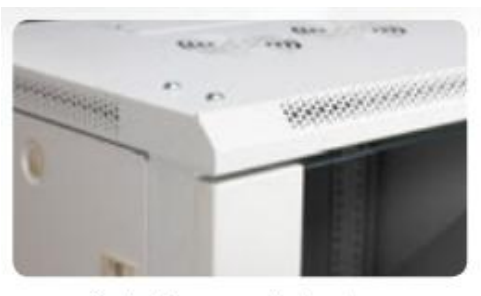
perforated frame, excellent cooling