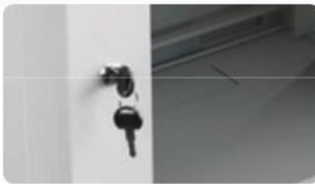
front door with security locks, easily use