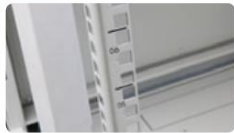
U numbering marked mounting rail