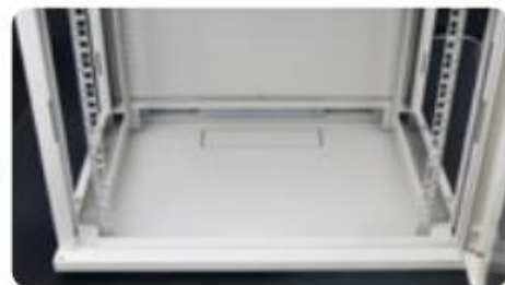
The top and bottom stripes are detachable to facilitate wiring.