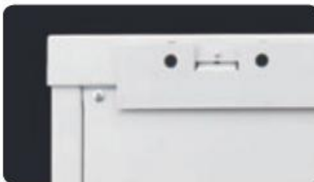
The design of back panel is convenient to install the wall