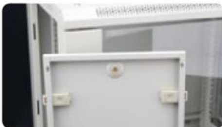
Detachable side panels, can be locked.