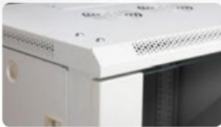
perforated frame, excellent cooling