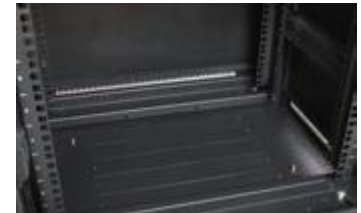
Moveable bottom panel for easy cable management