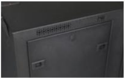
Detachable side panels, can be loacked.