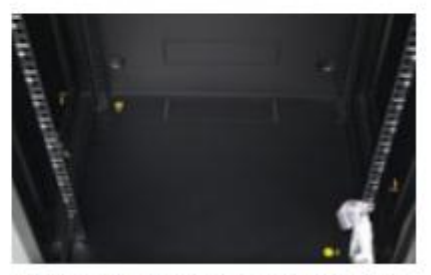
The bottom strip can be disassembled for easily cabling management