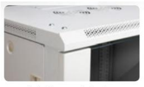
perforated frame, excellent cooling