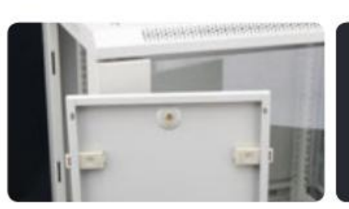
Detachable side panels, can be loacked.