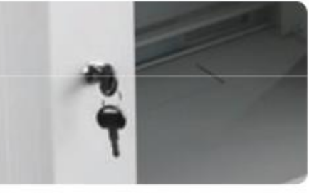
front door with security locks, easily use