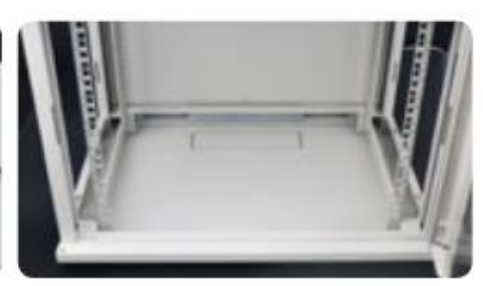
The top and bottom stripes are detachable to facilitate wiring.