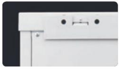
The design of back panel is convenient to install the wall