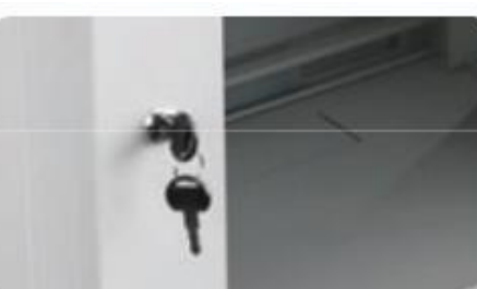
front door with security locks, easily use