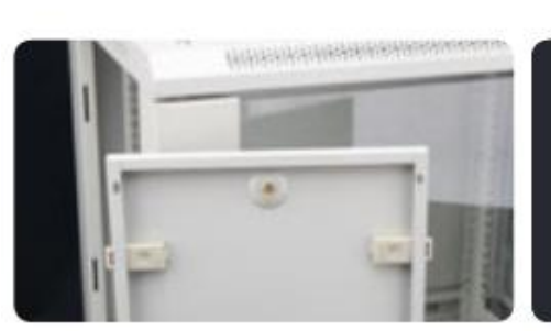
Detachable side panels, can be loacked.