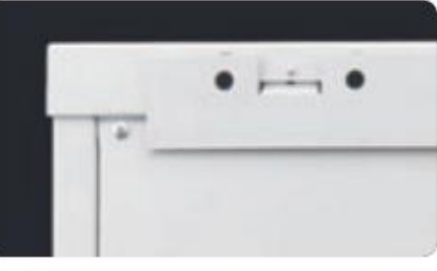
The design of back panel is convenient to install the wall