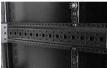
Trapezoid section mounting beam