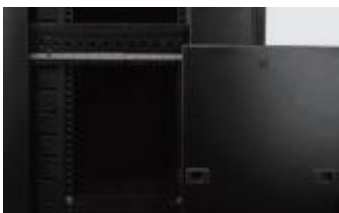
Detachable side panels, can be locked.