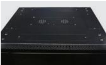
Several cable input panels meets different location cable routing request.