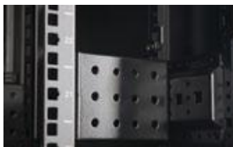
U height indicator vertical rail.