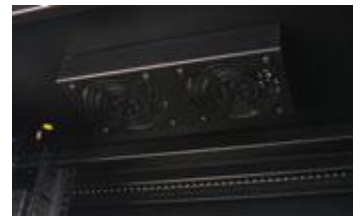
Fan units for dissipate heat