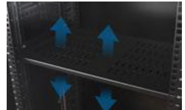
Adjustable steel tray, 150kg maximum loading capacity