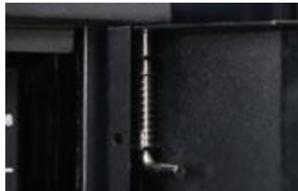
Quick opening latch structure, reversible door. The opening angle of the cabinet door is greater than 180 degrees.