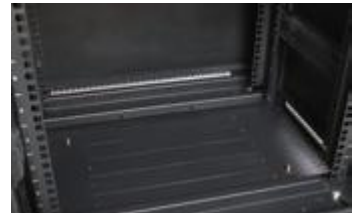
Moveable bottom panel for easy cable management